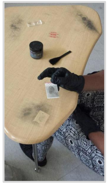
Fingerprint analysis at Ayer-Shirley High School

Because of popular television shows like CSI: Crime Scene Investigation many of these techniques are already familiar and interesting to students. Most students readily relate to the search for fingerprint matches with a national database, but until they take Fiorini's class, they probably don't know that graph theory is applicable to fingerprint analysis. Fingerprints formed by the ridge patterns on fingertips are unique to each individual, making their identification a workhorse in criminal forensics. A coarse classification based on prominent ridge features allows investigators to winnow the database to a smaller set of candidate matches, but it is not enough to make a definite match. To confirm a match they have to rely on a detailed analysis of finer characteristics within the ridge patterns. Fiorini applies concepts from graph theory to identify such characteristics and the