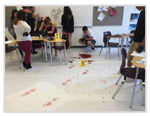
Crime scene at Ayer-Shirley High School

Mathematical forensics is the application of mathematics in forensic science, which, broadly speaking, is the application of scientific methods to gather and analyze evidence for use in a court of law. It turns out that forensic science is fertile territory for mathematical analysis. Basic statistical principles are used in computing body size and gender from measurement of bone fragments or stride length. Time of death estimates can make use of simple algebraic calculations to estimate body temperature over time or can employ more sophisticated methods that apply differential equations based on Newton's Law of Cooling.