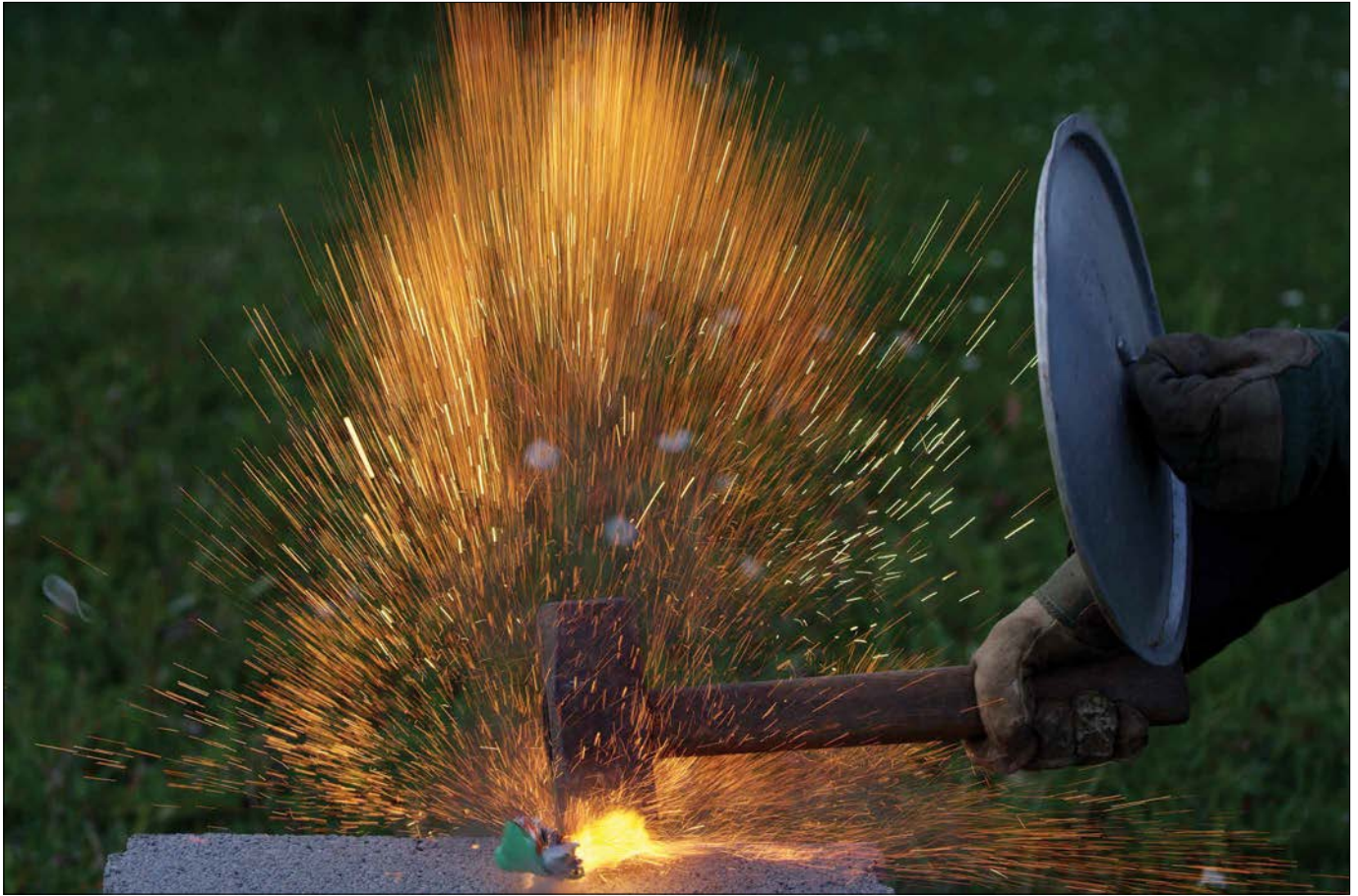
Small, novel threats—like a lithium ion battery fire—can have big impacts.

hazardous materials or sabotage. Uncertainty about what is in any given, and now fire-damaged, container, compounded by data integrity questions, will complicate the response. Large amounts of heavy black smoke in the middle of a densely populated area raises public health concerns in two states, including for ferry passengers. Various cargo owners may decide to sue each other or the vessel owner, further slowing cargo and vessel disposition. Longshore workers may refuse to work until air monitoring deems it safe.