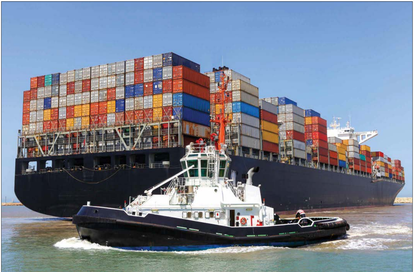
Delayed or diverted cargo can have serious impact on businesses far from port areas.

Additional considerations: The source of the fire might have been illegal or improperly stored